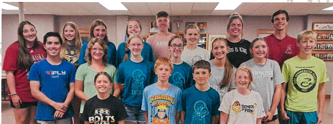
Totus Tuus 2025 7 th thru 12 th