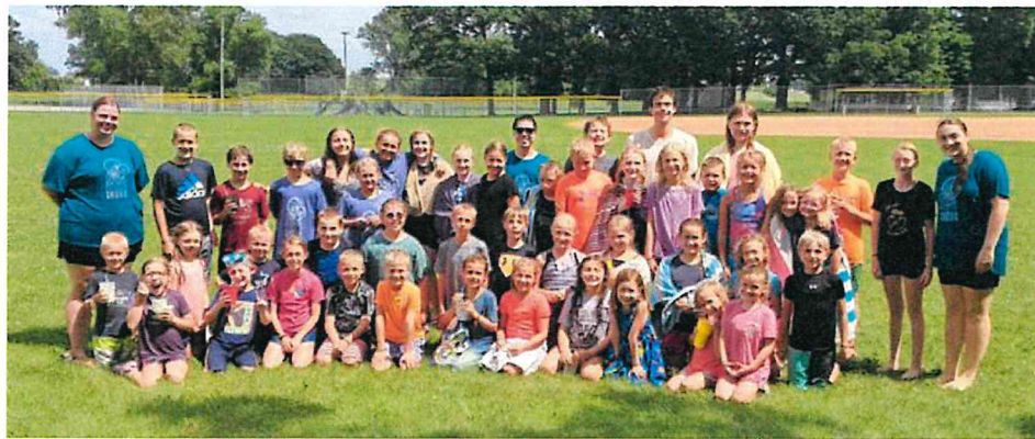
Totus Tuus 2025 1 st thru 6 th